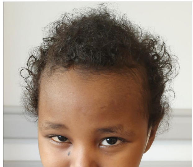
Fig. 4. The patient is in the 13 th month of treatment and is in remission.

Myeloid sarcoma (granulocytic sarcoma, chloroma) occurs when myeloblasts or immature myeloid cells settle in the extra medullary space.[2] It is thought that myeloid sarcoma originates in the bone marrow and then cells spread through the Haversian ducts to penetrate the lower periosteum, followed by soft-tissue masses. This pathophysiology explains the typical location of lesions close to bone structures.[4]