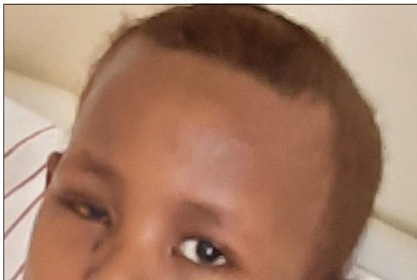
Fig. 3. The mass was largely resolved on the 45 th day of treatment.